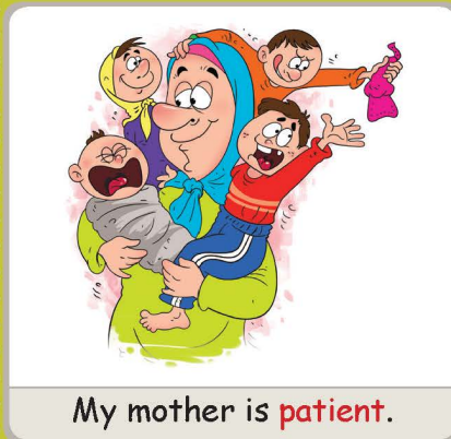
My mother is patient .