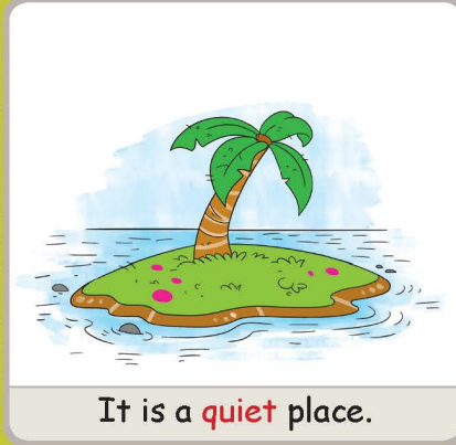
It is a quiet place.