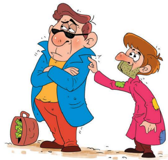
He is selfish .