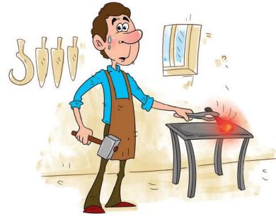
I am hard-working .