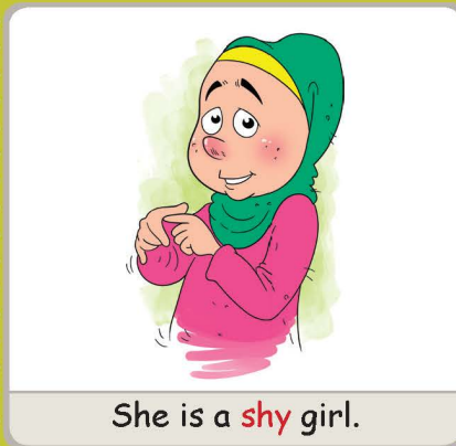
She is a shy girl.