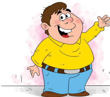
He is a pleasant boy.