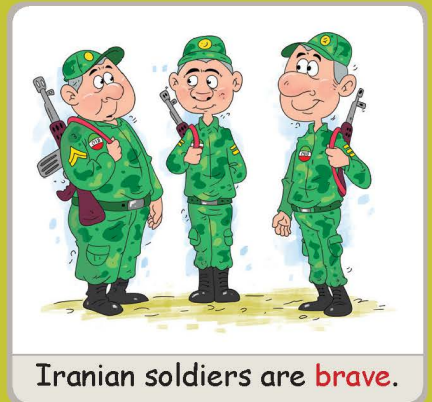
Iranian soldiers are brave .