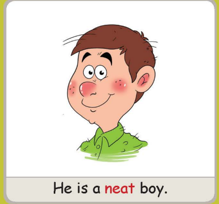
He is a neat boy.