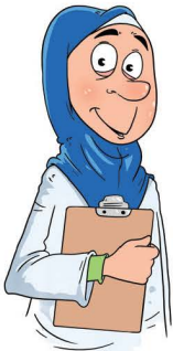
She is a helpful nurse.