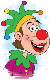
He is a funny man.