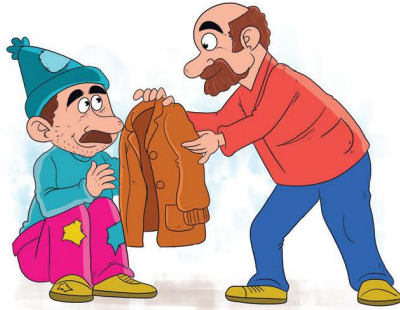
He is a generous man.