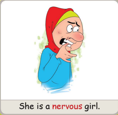
She is a nervous girl.