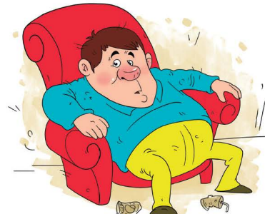
He is a lazy person.