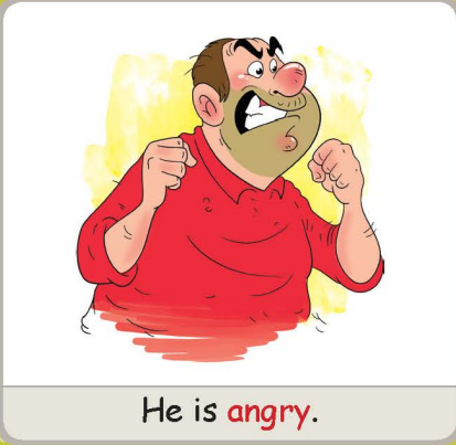
He is angry .