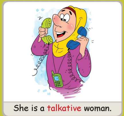
She is a talkative woman.