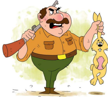
That man is cruel .