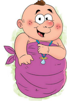
The baby is friendly .