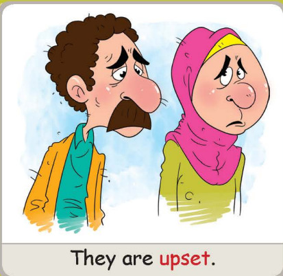
They are upset .