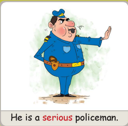
He is a serious policeman.