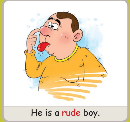
He is a rude boy.