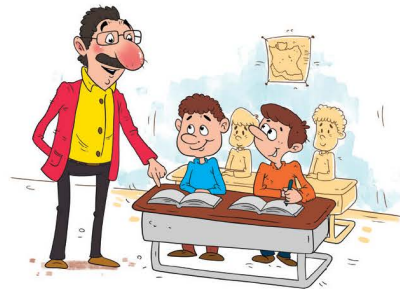
He is a kind teacher.