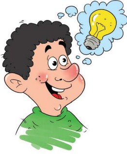
He is clever .